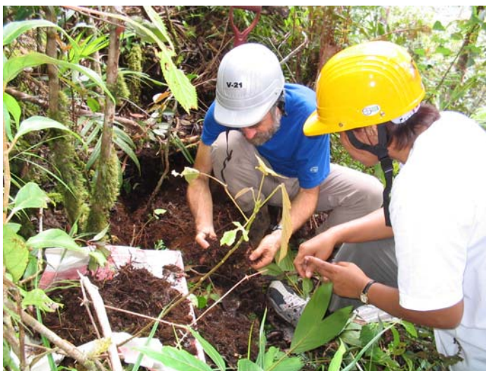
BRP researchers collect earthworms for the soil ecology study to assess soil ecological resource diversity and availability in selected sites of Mt. Malindang.